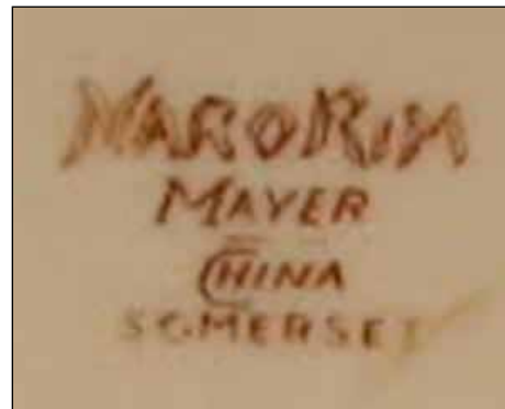
NaroRim 1930s to 1950