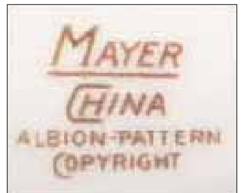
Albion Pattern Estimated circa 1950s