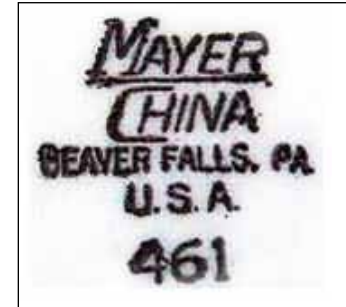
1940s - 1960s (with this date code, 1961)