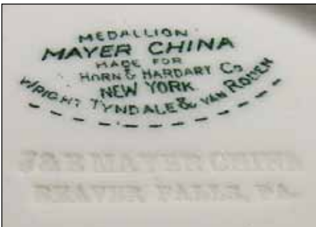
Incised mark is unknown. The Wright, Tyndale and Van Roden distributor mark would probably date between 1902 (when the first Horn & Hardart opened) and circa 1928, when the distributor went out of business.