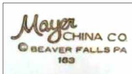
Circa 1960s - 1980s (with this date code, 1963)