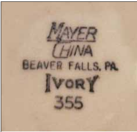
Ivory, 1940s - 1960s (with date code, 1955)

Click here to return to Mayer China IDwiki.