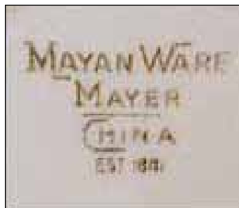
Mayan Ware 1930s - early 1940s