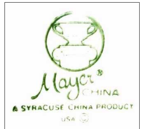
Circa 1989 - end of service