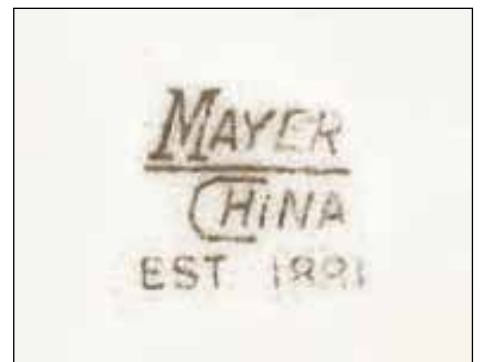
1930s - early 1940s