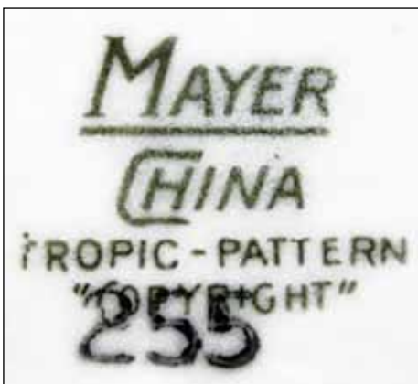
Tropic Pattern Circa 1950s (with date code, 1955)