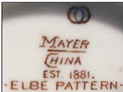
Elbe Pattern 1930s - early 1940s