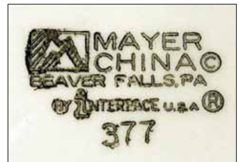
Interpace - 1968-1978 (with this date code, 1977)