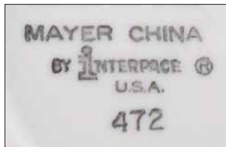
Interpace - 1968-1978 (with this date code, 1972)