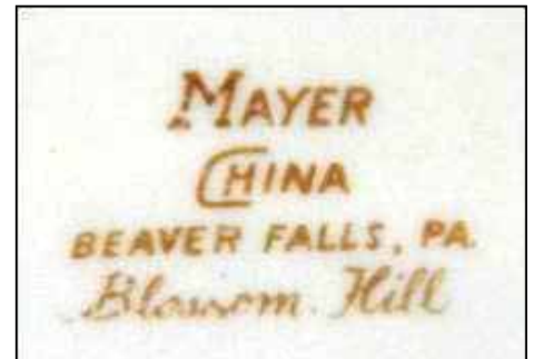
Blossom Hill Pattern 1940s - 1950s