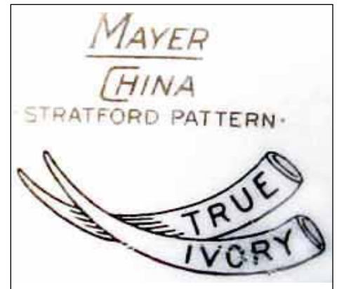
True Ivory Circa 1930s