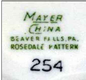
Rosedale Pattern Second quarter 1954