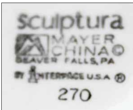
Sculptura - circa 1970-1978 (with this date code, 1970)