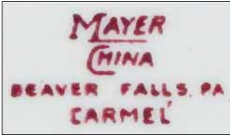
Carmel Pattern 1940s - 1950s

Click here to return to Mayer China IDwiki.