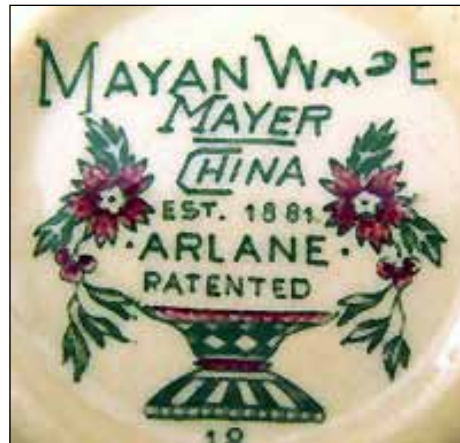
Arlane Pattern 1930s - early 1940s